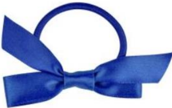
Ribbon Bow on Elastic (optional)