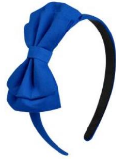
Headband with Bow (optional)