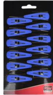
Snap Hair Clips (optional)