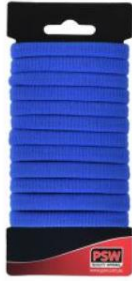
Coloured Elastics (optional)